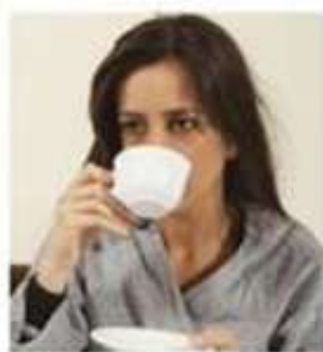
3 have some tea