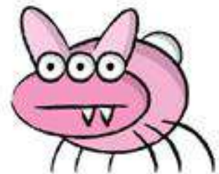
Henry, the pigspider