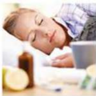
2 lie down