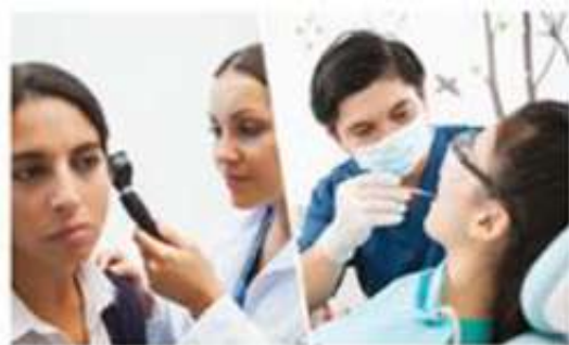
4 see a doctor / see a dentist