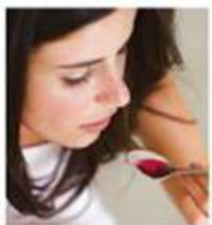
1 Take medicine