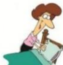
Make the bed