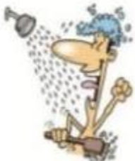
Take a shower