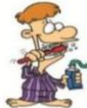
Brush the teeth